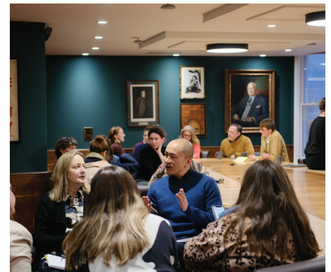
Equity members attend an ITC training session (credit - Equity Staff).