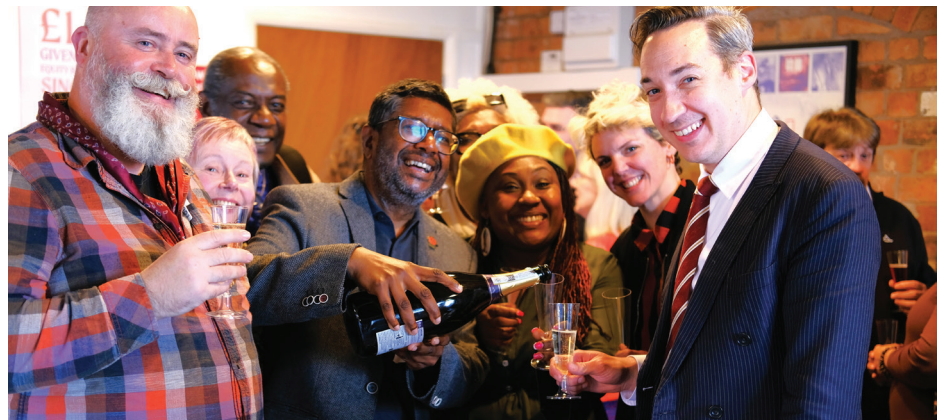
Equity Members and Staff celebrate the opening of the Midlands office in Birmingham.