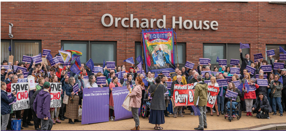
Equity Members and Staff protest in Derry for greater arts funding.