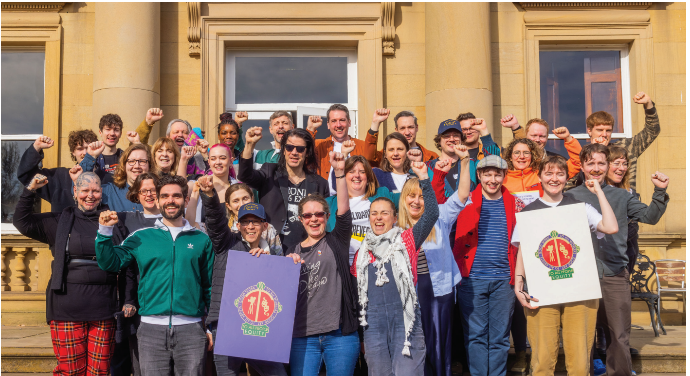
Equity Members and Staff at Wortley Hall for a weekend of activist training.