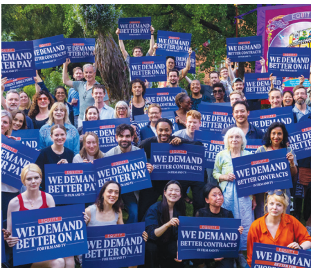
Equity members demand better in film and TV.